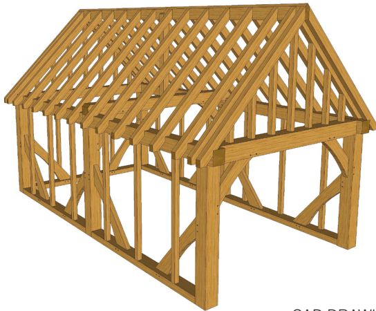
CAD DRAWING OF THE OAK KIT